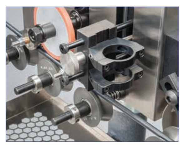
Shown with ink jet bracket for round print head