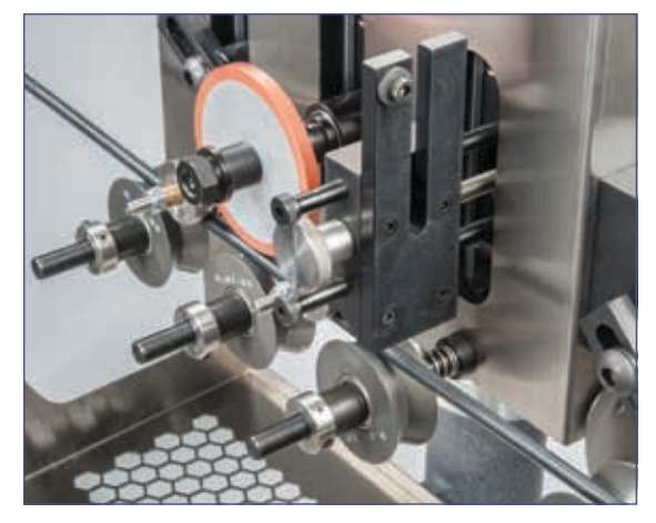
Shown with ink jet bracket for rectangular print head