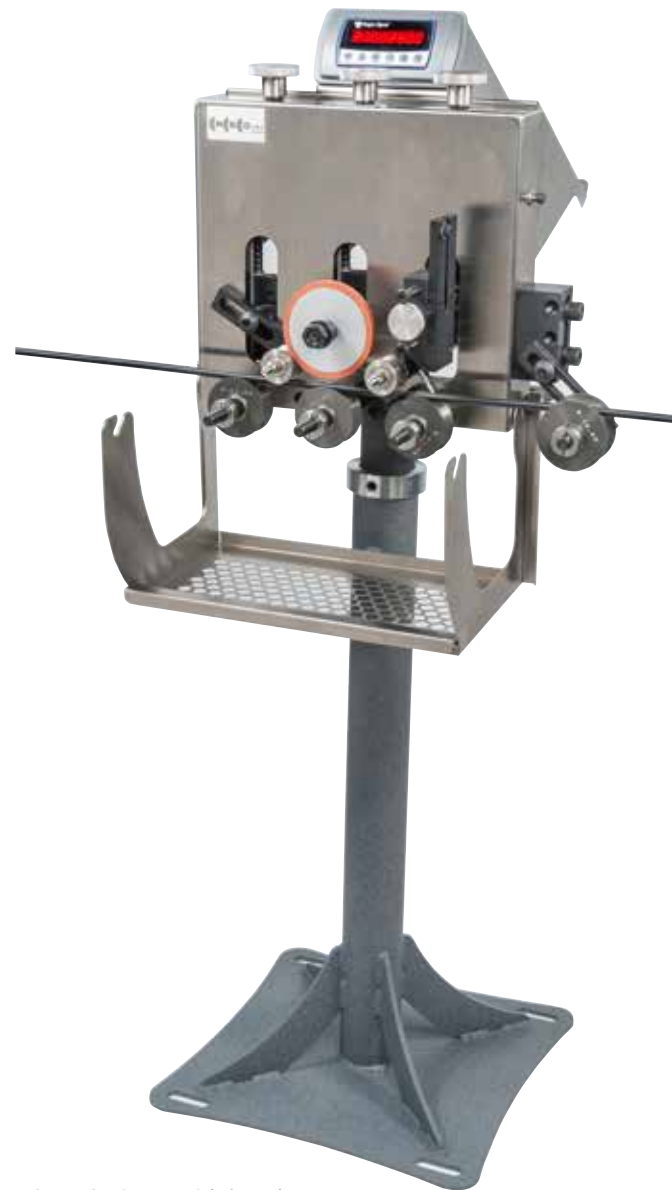
S-10 Series II with length counter

UPGRADEABLE: No need for costly upgrades. Simply change out ink jet head bracket, encoder bracket, and coupling when replacing your existing ink jet printer. Brackets and couplings available at W. Gillies Technologies, LLC - Member RSD Group.