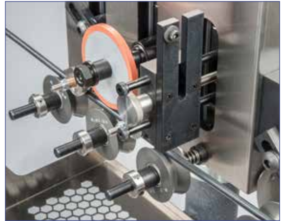
Shown with ink jet bracket for rectangular print head