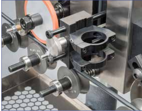
Shown with ink jet bracket for round print head