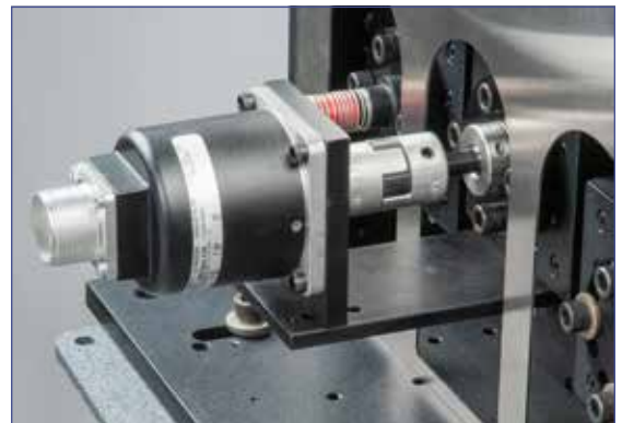
Shown with bracket and coupling for 3/8" shaft encoder