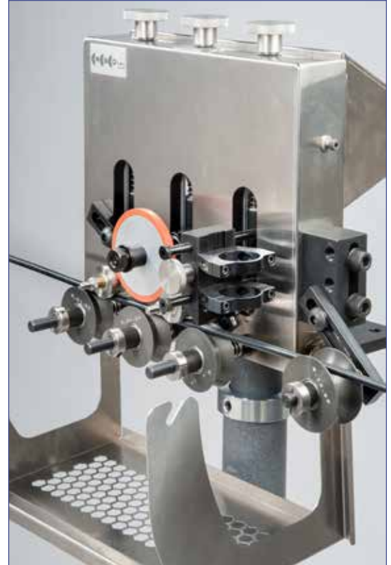
S-10 Series II & III